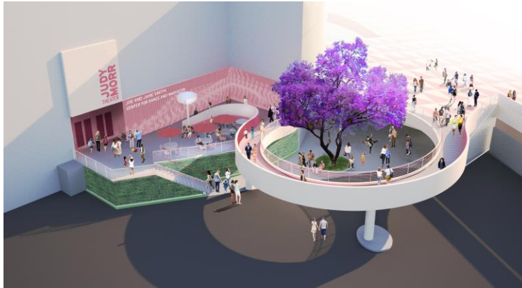
Entrance to Center for Dance and Innovation

round programs and performances as well as guest amenities that include a café, public stage, shaded seating areas, WiFi and enhanced lighting and sound. A visually striking grand staircase will connect Segerstrom Hall to the Argyros Plaza below. The Center for Dance and Innovation, which includes the Judy Morr Theater, studios of the American Ballet Theatre William J. Gillespie School and new school for children with physical and cognitive disabilities, will feature its own sweeping entranceway and public patio for socializing.